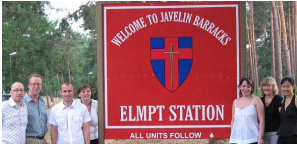
MBA Students at Elmpt Station.